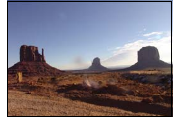
Monument Valley, UT

The signal must be very strong because IEA recorded the same signal simultaneously at